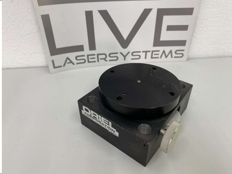
Oriel optics rotation and 2 axis tilt table. Good condition. Price : 50,-€