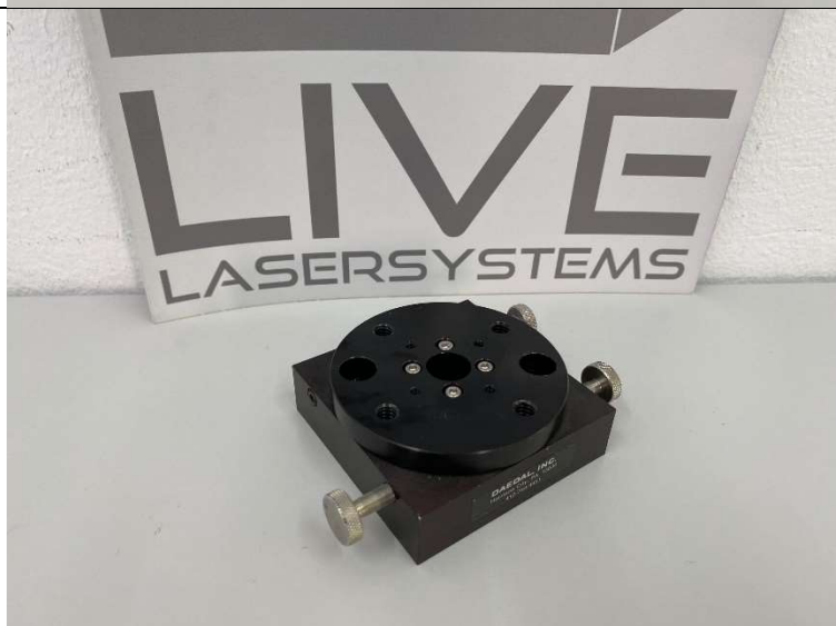
Daedal rotation mount with setscrews. Good condition. Price : 40,-€