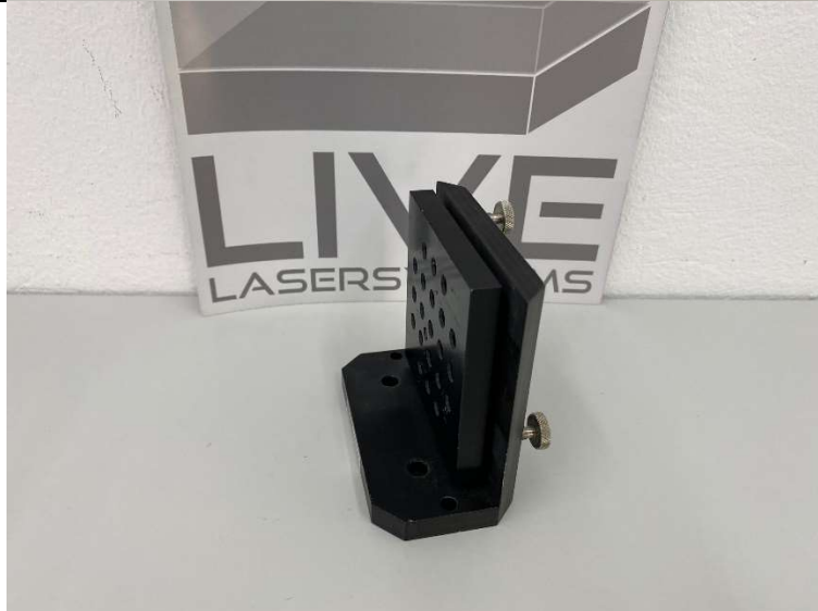
A big mirrorholder with 2 axis adjustment. Price : 40,-€