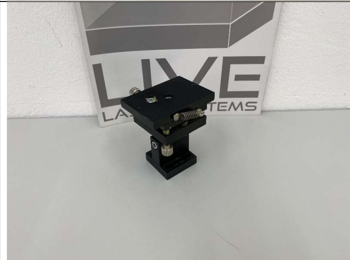
Table for PCAOM out of a old lasersystem. Don't know the manufacturer. Price : 20,-€

Optosigma heavy duty X/Y table with micrometers. Well condition. Price : 100,-€